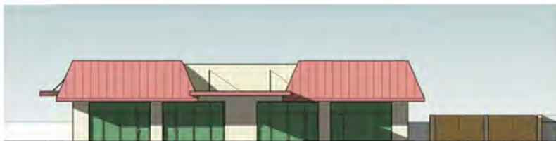
① NORTH ELEVATION - BUILDING C 1/16" = 1'-0"