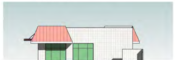
④ WEST ELEVATION - BUILDING C 1/16" = 1'-0"