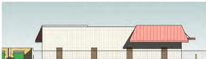
③ SOUTH ELEVATION - BUILDING C 1/16" = 1'-0"