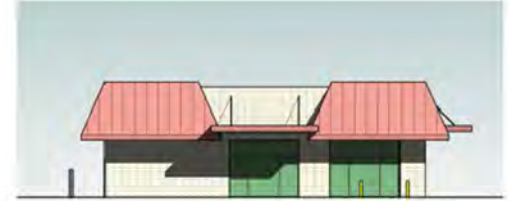
② EAST ELEVATION - BUILDING C 1/16" = 1'-0"